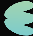
Fav Icon 2

The Esfer favicon graphic is linked with the Esfer platform. It is a smaller representation of the brand for the browser and for the mobile and interfaces.